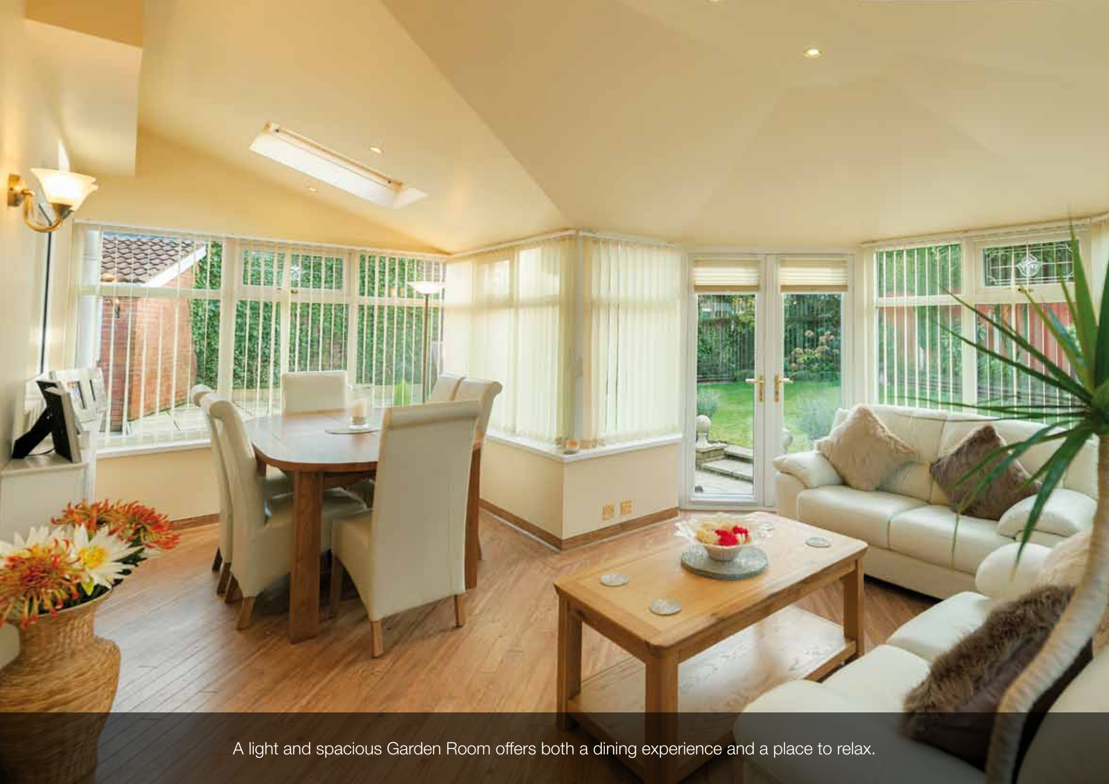
A light and spacious Garden Room offers both a dining experience and a place to relax.