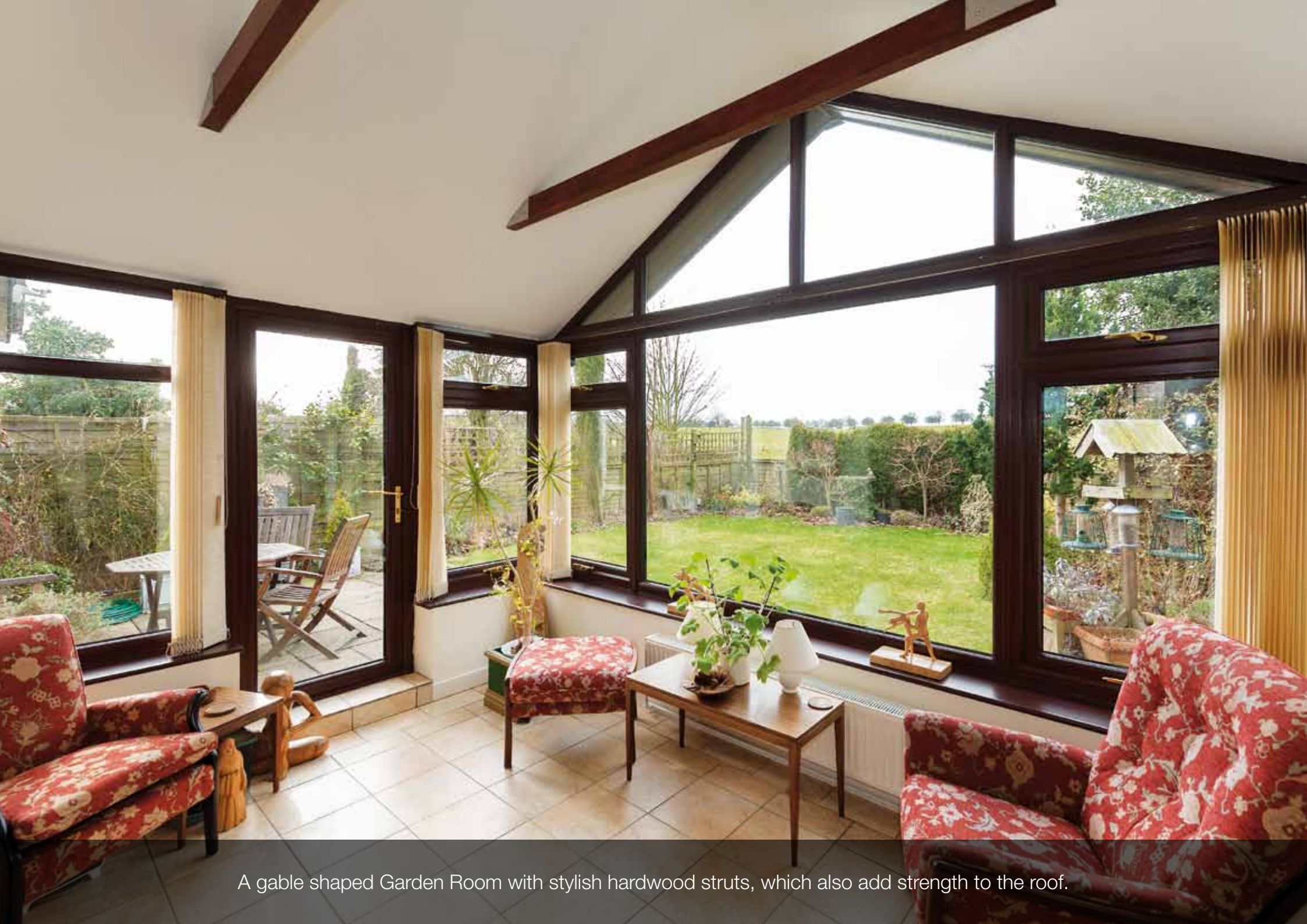
A gable shaped Garden Room with stylish hardwood struts, which also add strength to the roof.