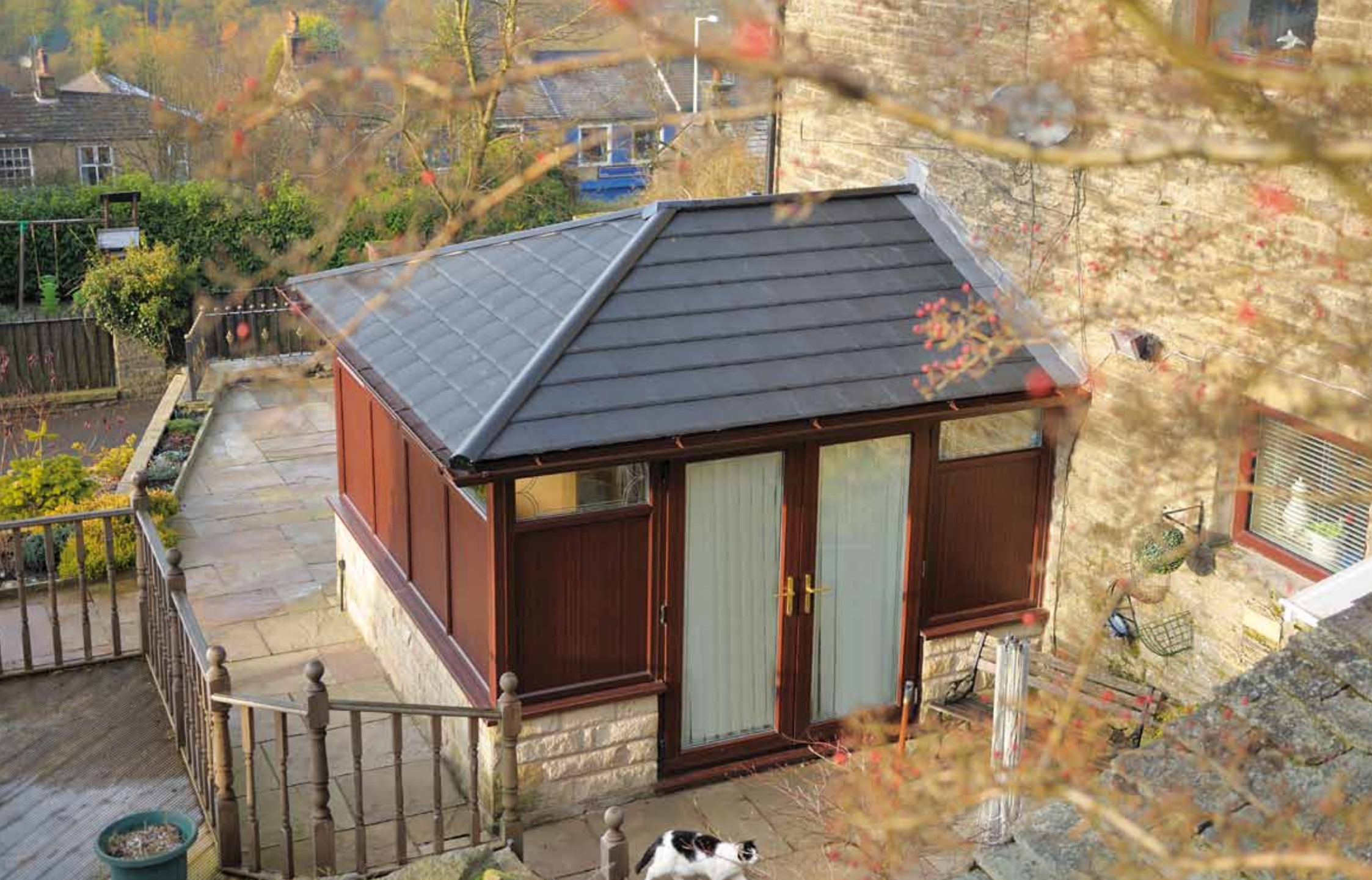
Stunning Pennine Garden Room, designed to withstand the harshest climates.