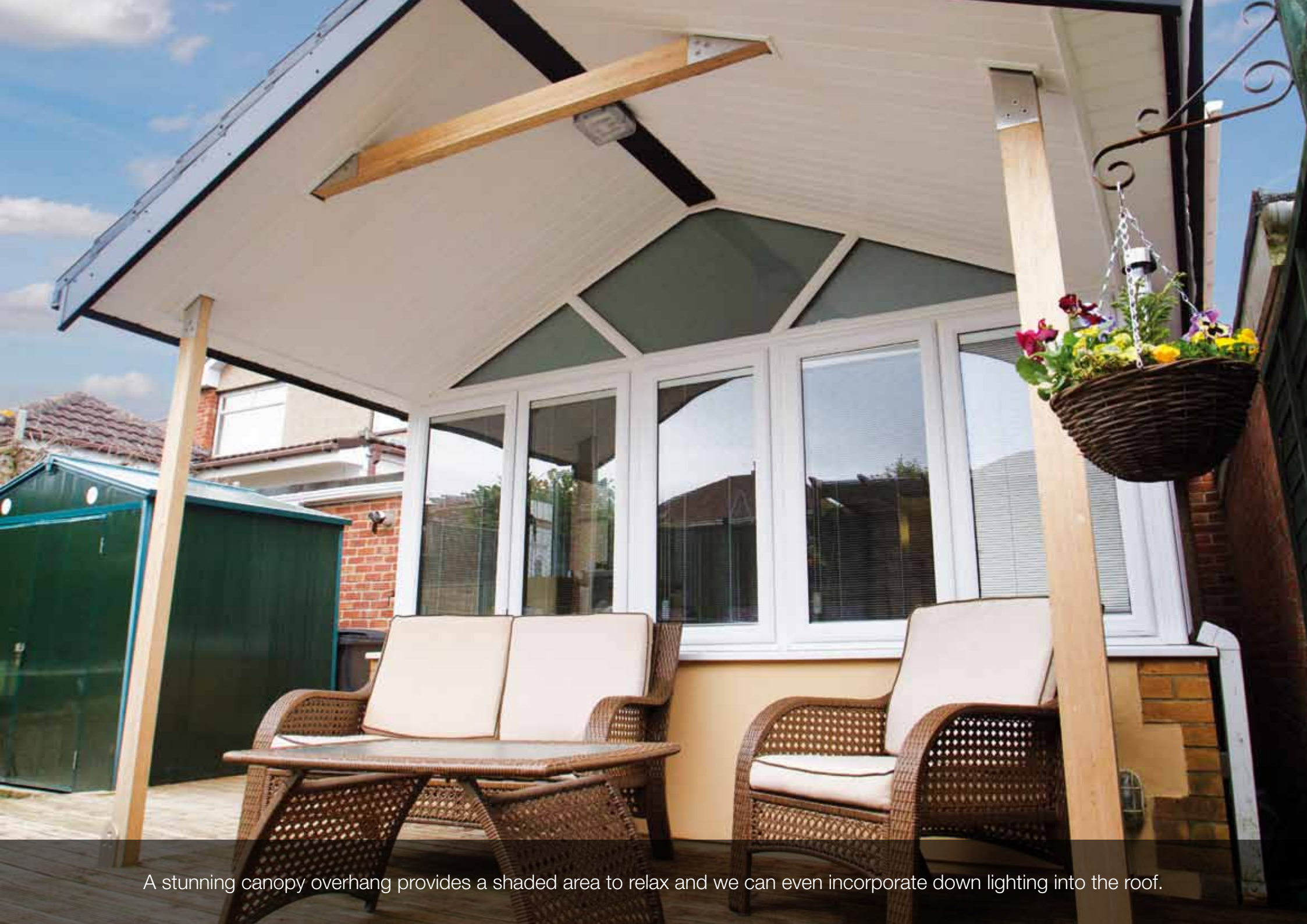
A stunning canopy overhang provides a shaded area to relax and we can even incorporate down lighting into the roof.